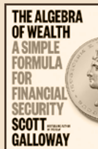
THE ALGEBRA OF WEALTH - Scott Galloway