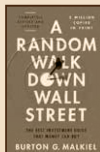
A RANDOM WALK DOWN WALL STREET - Burton Malkiel